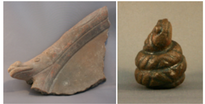
Figure 44. Snake adornments with raised heads: (a) hollow snake rim on vessel fragment, Erin, Trinidad, approximately 8 in. length; (b) coiled snake adorno with incised markings, Bacolet Stadium, Tobago, approx. 2 in. height. (a) National Museum and Art Gallery, Trinidad; (b) Tobago Museum, Tobago.

The few specimens indicate that snakes took either the form of coiled adornos or that of serpentine tube rimming the circular or oval rims of vessels. In both cases the snakes raise their heads off the ceramic ( Figures 44 a and b ). Zone-polished nubbins among the triangular incisions on some snake rims from Venezuela evoke the circular markings of green anacondas ( Eunectes murinus ). But Antillean snake rim decorations are less elaborate (compare Figures 44 and 45 ).