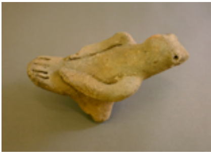
Figure 43. Swooping bird adorno, unknown site, Grenada, 4 in. length. Smithsonian National Museum of the American Indian Cultural Resources Center, Suitland, Maryland.

Snakes. A depiction of a snake's head could easily be mistaken for that of a lizard. So snakes cannot be identified with certainty except by depictions of their tubular bodies rimming vessels or rarely, coiled or undulating on vessel rims and walls. Neither snakes nor lizards occur with any frequency in Saladoid ceramics of the Lesser Antilles so that identifying the few that exist in the region's collections is relatively easy.