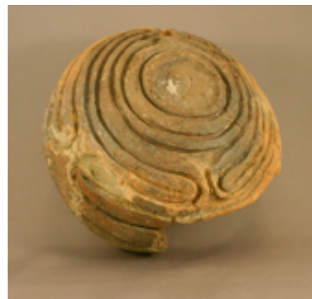
Figure 55. Bowl with deeply incised circular, flexed-frog labyrinth motif on underside, Land's End, Barbados, approximately 7 in. diameter. Barbados Museum, Barbados.