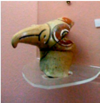
Figure 35. Frigatebird spout fragment, unknown site, Martinique, 3 1/4 in. height. Musée Départemental d'Archéologie Précolombienne et de Préhistoire, Martinique.