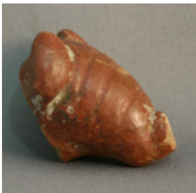
Figure 6. Armadillo adorno with incised bands, unknown site (probably Pearls), Grenada, 1 1/2 in. length. Nelson's Dockyard Museum, Antigua.

Armadillos. An obviously mammalian adorno with long ears sometimes wider on their tops than bases; attached to a head that is rounder on the crown and comes to a snubbed point, with a convex forehead and any kind of incised and/or modeled banding across that forehead was identified as an armadillo (Figure 6). Banding on several vessel shards, especially from Grenada, also seemed to indicate that an armadillo shell pattern, perhaps of the nine-banded armadillo ( Dasypus novemcinctus ), had been incised on the outer walls of vessels (Figure 7). vii