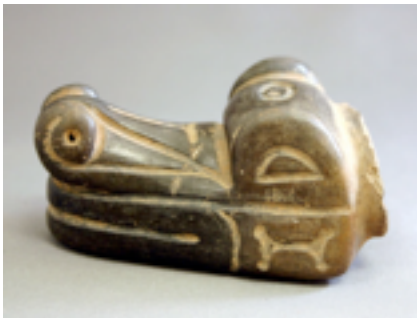
Figure 47. Stylized, incised caiman adorno, Saladero, Venezuela, 2 3/4 in. length. Yale Peabody Museum of Natural History Anthropology Department, Greenwich, Connecticut.

Crocodilians . Images of crocodilians in the Antilles restrict the more diverse crocodilian imagery of the Saladoid mainland to a rigid scheme of stylizations (compare Figures 47 and 48 to Figures 49 and 50). The heads of the Caribbean caiman adornos are flat, long tabs that presumably protruded off the sides or rims of vessels before they neatly snapped off as the pots broke. Mouths are located along the leading edge of these crocodilian tabs and lunette-shaped eyes, flat on the bottom and punctated in the center, are located on the side edges (Figures 49 and 50). Noses are the only facial feature located on the top of the tab, along with incised crosshatched, painted and/or modeled patterns suggesting the scales and scutes of the animal. The natural referent for these stylized tabular adornos would have been the black or speckled caiman ( C. intermedius and C. sclerops respectively) of the Orinoco and other rivers of northeastern South America, and Trinidad. Yearly flooding of the Orinoco also would have washed exhausted caimans out as far as St. Vincent, the Grenadines and Grenada in Saladoid times as they have in recent centuries. xiii