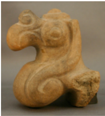
Figure 1. Distinguishing caruncula atop hooked beak of the king vulture on vessel rim adorno, unknown site (probably Saladero), Venezuela, approximately 3 in. height. Museum of Antigua and Barbuda, Antigua.

these. Saladoid potters sometimes selected an emblematic feature of a zoomorph to represent the species or class metonymically, without much observation of other parts of the animal, such as the pronounced caruncula and hooked beak of a vulture ( Figure 1 ). The heads and faces of animals are very often the only part of a zoomorph featured in an adorno but the torso and legs of some land mammals and the shells of turtles and armadillos are also common subjects for the Saladoid potter. Tails also appear with some frequency, especially on effigy pots featuring heads and feet or flippers. ii