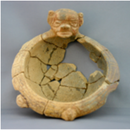
Figure 21. Funerary bat faced vessel, Atagual, Trinidad, approximate 10 in. diameter. Peter Harris Collection, Pointe-à-Pierre Wildfowl Trust, Trinidad.