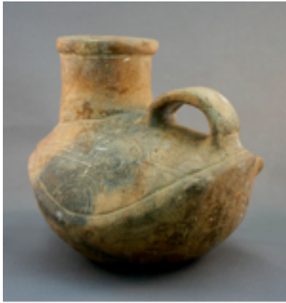
Figure 38. Incised duck-shaped vessel, St. Catherine's, Trinidad, approximately 4 1/2 in. longer diameter. Peter Harris Collection, Pointe-à-Pierre Wildfowl Trust, Trinidad.