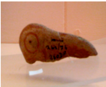
Figure 29. Pelican adorno, unknown site, Martinique, 2 1/2 in. length. Musée Départemental d'Archéologie Précolombienne et de Préhistoire, Martinique.