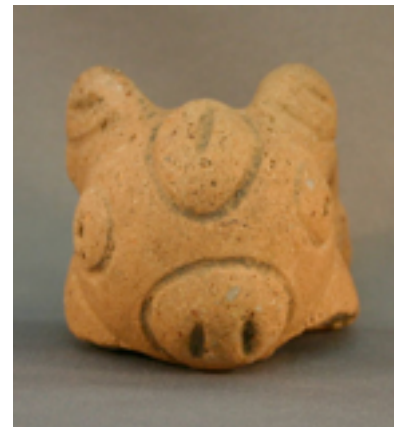
Figure 5. Unidentified mammal adorno, Friendship, Tobago, approximately 1 1/2 in. width. Tobago Museum, Tobago.

of some zoomorphs on the mainland is often not a factor in the islands. The narrow speciation of land mammals in any insular environment assists with identifying these zoomorphs more assuredly by process of elimination. Likewise, though the Caribbean boasts exceptionally high reptilian biomass (Malhotra and Thorpe 1999: 21) and many bird species as well (including many endemic species) (Raffaele et al. 1998), these belong to a relatively small number of genera, again aiding the identification of, say, bats or even sea turtle species in Saladoid ceramics. Additionally, unlike the uncertainty that can plague identifications of zoomorphs in two-dimensional Pre-Columbian imagery such as painted ceramic adornments or rock art (and in textile and basket fragments of some mainland cultures as well), Saladoid adornos give far more indications, in three dimensions, with a degree of naturalism, and sometimes with color markings, of which animals they are meant to represent.