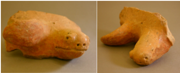
Figure 59. Swimming turtle adorno, unknown site, Carriacou, approximately 3 in. width. Smithsonian National Museum of the American Indian Cultural Resources Center, Suitland, Maryland.