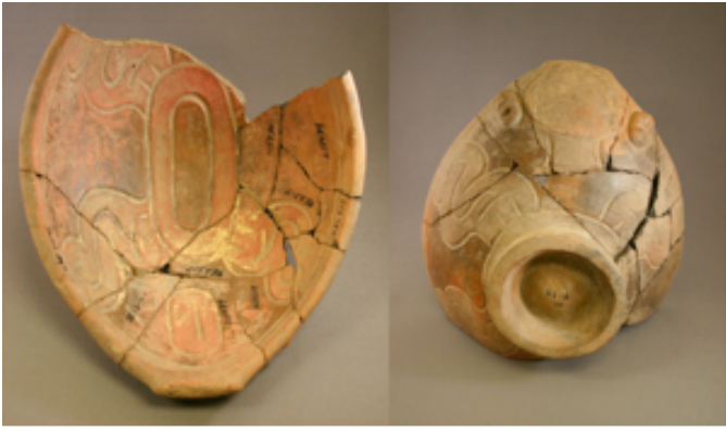
Figure 56. Interior and exterior of annular navicular vessel with flexed-frog incised polychrome motif, Saladero, Venezuela, 6 x 5 3/8 in. Yale Peabody Museum of Natural History Anthropology Department, Greenwich, Connecticut.