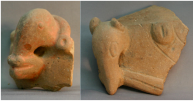
Figure 13. Anteater D-strap handle adornos: (a) downward-facing, collared anteater on vessel rim, unknown site, Tobago, 2 1/2 in. x 2 in.; (b) upward-facing anteater on vessel rim, Lovers' Retreat, Tobago, 3 in. length (adorno only). Tobago Museum, Tobago.

Monkeys. The land mammals described above, all can be classed together for their general shape with rounded heads tapering into narrower muzzles. But monkey adornos naturally employ a somewhat different morphology. Though the prognathic mouths of these images might be likened to that of other mammals, the otherwise vertical formation of their faces, heavy brow ridges and/or faces framed by hairlines distinguish monkey depictions clearly from those of quadrupeds ( Figures 14 and 15 ). However, these simian features closely resemble the stylizations of anthropomorphs that appear in Saladoid ceramics. Even the laterally located nostrils so typical of the Platyrrhini branch of primates from which New World monkeys all descend do not clearly distinguish monkeys from people in Saladoid ceramics. Some stylized noses could represent nose ornaments worn by humans ( Figure 15 ). Identifications of monkeys can thus be over-reported or under-reported in surveys of Saladoid ceramics, especially if the Saladoid penchant for hybrid imagery is not taken into consideration. I was conservative in my count of these would-be monkeys and thus found them fairly uncommon ( Table 1 ).