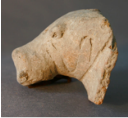
Figure 16. Manatee adorno, Morel, Guadeloupe, 1 in. x 2 1/2 in. Direction Régional des Affaires Culturelles, Guadeloupe.

near the rim, as if meant to peek just above the surface of the liquid contents thereof (Chanlatte Baik and Narganes Storde 2002: 27). While manatees appear on the pottery of both early ceramic cultures of the Antilles, they do not appear in the ceramics of the Lower Orinoco.