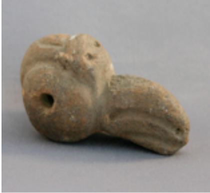
Figure 34. Wading bird (possibly ibis) adorno, Erin, Trinidad, 1 3/4 in. length. National Museum and Art Gallery, Trinidad.