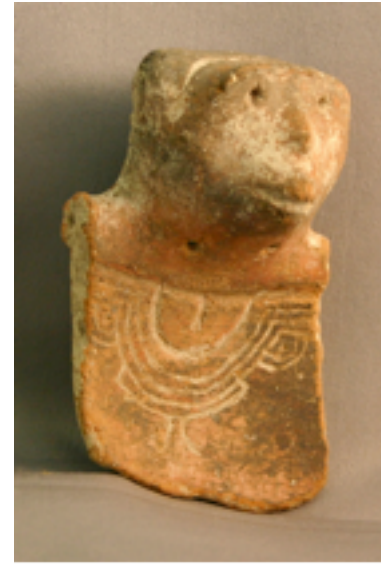
Figure 14. Monkey vessel fragment with incised motif, Chancery Lane, Barbados, 3 1/2 in. x 2 in. Florida Museum of Natural History, Gainesville, Florida.

Monkeys. The land mammals described above, all can be classed together for their general shape with rounded heads tapering into narrower muzzles. But monkey adornos naturally employ a somewhat different morphology. Though the prognathic mouths of these images might be likened to that of other mammals, the otherwise vertical formation of their faces, heavy brow ridges and/or faces framed by hairlines distinguish monkey depictions clearly from those of quadrupeds ( Figures 14 and 15 ). However, these simian features closely resemble the stylizations of anthropomorphs that appear in Saladoid ceramics. Even the laterally located nostrils so typical of the Platyrrhini branch of primates from which New World monkeys all descend do not clearly distinguish monkeys from people in Saladoid ceramics. Some stylized noses could represent nose ornaments worn by humans ( Figure 15 ). Identifications of monkeys can thus be over-reported or under-reported in surveys of Saladoid ceramics, especially if the Saladoid penchant for hybrid imagery is not taken into consideration. I was conservative in my count of these would-be monkeys and thus found them fairly uncommon ( Table 1 ).