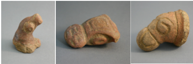
Figure 17. Styles of Saladoid manatee adornos, unknown sites, St. Vincent, Saladoid: (a) upturned head from vessel rim, 1 in. length; (b) tabular lug with incised snout and cranial design, 1 3/4 (length) x 1 1/2 in (width at broken base); (c) stylized head with curvilinear incisions on snout and eyes, 1 in. x 1 3/4. St. Vincent and the Grenadines National Trust Museum, St. Vincent.