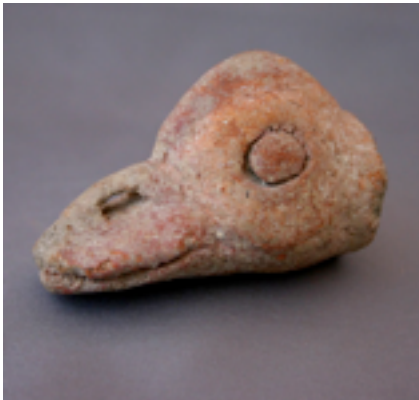
Figure 39. Duck adorno with nostril loop (perhaps imitating large nares of whistling ducks), unknown site, Guadeloupe, 2 1/4 in. Guadeloupe: Musée Edgar Clerc.