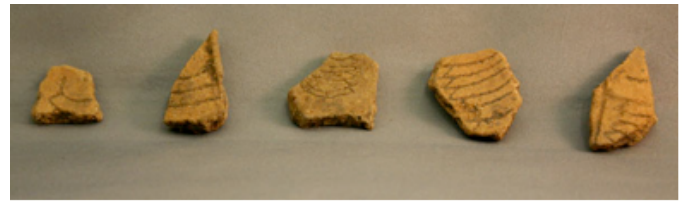
Figure 7. Vessel shards with incised designs resembling banded armor of armadillos, Pearls, Grenada, 1/2-1 1/2 in. width. Florida Museum of Natural History, Gainesville, Florida.

Opossums. Adornos were identified as opossums when their heads bore some overall resemblance to armadillo adornos in profile but exhibited no horizontal banding on the head and had a more bulbous nose. There appears to have been some effort on the part of Saladoid potters to evoke the facial color markings of the black eared opossum ( Didelphis marsupialis ) especially, not in slip paint, but in incisions that frame the eyes and face, terminating at the bulbous nose (Figure 8 a and b). The mouths of these apparent opossum adornos are incised near or on the underside of the head, giving the mouth a wincing expression much like that of the actual animal (Figure 9). The ears of these adornos are not as prominent as those on the armadillo or dog adornos. In fact the forms of armadillo, opossum and dog heads are quite similar before the addition of ears, mouths or other distinguishing features, suggesting that Saladoid potters may have learned a basic syllabary of forms (perhaps from tradition-bearing instructors) and varied features to make different animals.