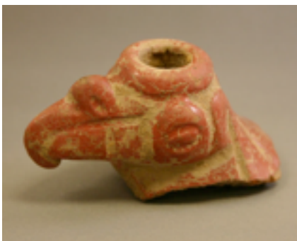
Figure 27. Vulture spout, Saladero, Venezuela, 2 3/4 in. length. Yale Peabody Museum of Natural History Anthropology Department, Greenwich, Connecticut.