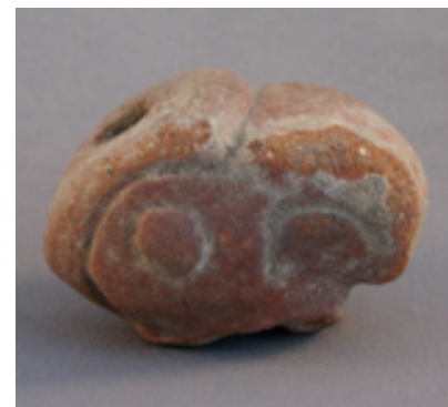
Figure 41. Parrot spout, Erin, Trinidad, 1 3/4 in. length. National Museum and Art Gallery, Trinidad.

Psittacids are the only colorful species commonly depicted in Saladoid ceramics. Other forest birds are exceedingly rare. The few I found might represent songbirds such as those mentioned in later Taíno lore, perhaps twilight singing birds. Adornos representing heads and, sometimes, entire bodies of these birds pay little attention to speciation. At least one specimen showed the bird in flight ( Figure 43 ).