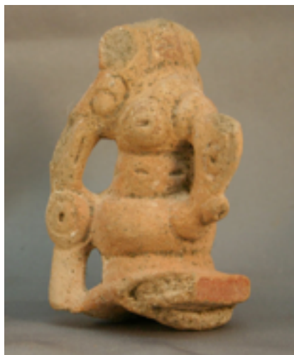
Figure 2. Composite, fanciful zoomorphic adorno, unknown site (probably Saladero), Venezuela, approximately 3 in. height. Museum of Antigua and Barbuda, Antigua.