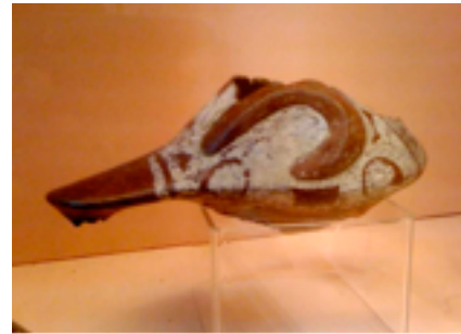
Figure 37. White-on-red duck vessel fragment, unknown site, Martinique, approximately 10 in. length. Musée Départemental d'Archéologie Précolombienne et de Préhistoire, Martinique.

Ducks. The bodies and distinctive flat bills of ducks appear on a number of very different ceramic adornments. Several duck adornments incorporate a major part of the ceramic vessel rather than being confined to the adorno form as with many other zoomorphs. Some duck vessels adopt the shape of a duck's head ( Figure 37 ) while others take the duck's body floating on water as their model ( Figure 38 ). Two classes of adornos seem to represent the duck's head. One of these represents a fairly naturalistic, perhaps whistling duck species ( Dendrocygna genus) ( Figure 39 ). The other seems to reveal itself as a secondary image in hybrid representations of turtles. In this second variety of duck adorno, a highly stylized sub-group of turtle adornos with tall lateral (rather than sagittal) crowns atop their heads seem to become duck heads much like the less ambiguous duck adornos of the first variety, but only when the turtle adornos are laid face up ( Figure 40 ).