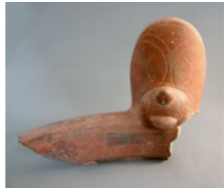
Figure 62. Turtle adorno with incised crown, unknown site, St. Vincent, approximately 4 1/2 in. height. St. Vincent and the Grenadines National Trust Museum, St. Vincent.