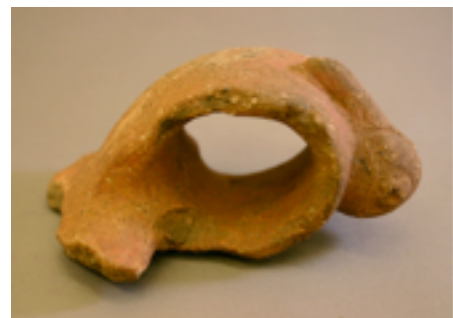
Figure 32. Pelican strap handle, unknown site, Carriacou, 3 in. length. Smithsonian National Museum of the American Indian Cultural Resources Center, Suitland, Maryland.