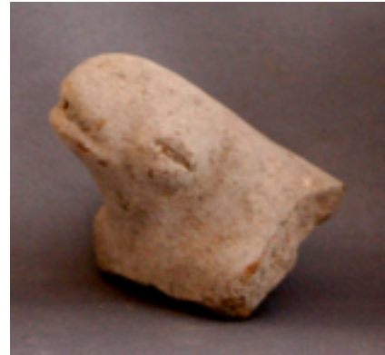
Figure 65. Possible cetacean (pilot whale) adorno, unknown site, Antigua, 1 in. x 1 in. Reg Murphy Collection, Antigua.

small modeled dolphin found in the Grenadines and singular dolphin and perhaps pilot whale adorno found in Antigua ( Figures 65 and 66 ).