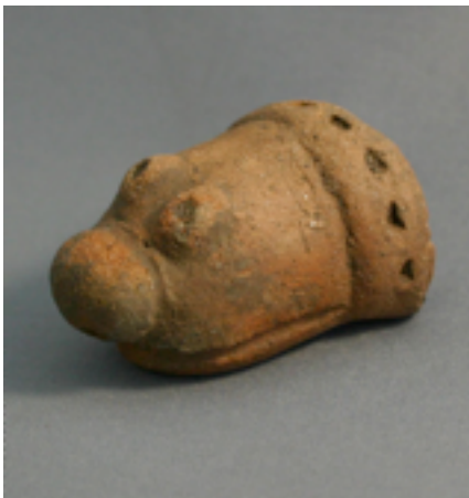
Figure 60. Freshwater turtle adorno, Escape, St. Vincent, 2 in. length. St. Vincent and the Grenadines National Trust Museum, St. Vincent.