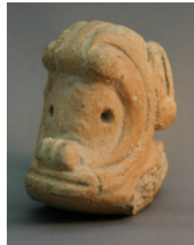
Figure 15. Stylized monkey adorno, Mt. Irvine, Tobago, 2 in. x 1 in. Tobago Museum, Tobago.

Manatees. A class of mammal adornos with large snouts and no ears was identified as West Indian manatees ( Trichechus manatus ). A particularly naturalistic Saladoid manatee adorno with Huecoid-style incisions was photographed in Guadeloupe ( Figure 16 ), but a variety of stylized variants appeared in other islands ( Figures 17 a, b and c ). Purely Huecoid manatee adornos also exhibited great variety and, fascinatingly, were often combined in hybrid forms with dogs, which emerged from their noses like the secondary adornos (or “alter-egos”) that emerge from the foreheads of Saladoid adornos ( Figure 18 ). Some, simpler Huecoid manatee adornos were located in an unusual position on the inside of vessels