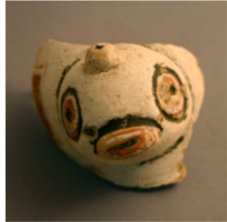
Figure 61. Stylized turtle adorno with cranial protuberance, Vivé, Martinique, approximately 1 1/2 in. width. Direction Régional des Affaires Culturelles, Martinique.