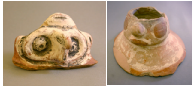
Figure 23. Different Saladoid owl depictions from Montserrat: (a) adorno with traced eyes and pointed beak, unknown site, approximately 2 in. width; (b) white-on-red vessel spout, unknown site, 5 1/2 in diameter (at base). Smithsonian National Museum of the American Indian Cultural Resources Center, Suitland, Maryland.

Owls. Saladoid ceramic depictions of owls and other night birds are distinguished by their large eyes, often-round faces and decurved or wedge-shaped beaks, usually in combination ( Figure 23 a and b ). Some night bird adornos and vessel fragments, whether Saladoid or Huecoid, display the prominent ear tufts of endemic screech owls ( Otus genus) ( Figure 24 ); others, the heart-shaped faces of barn owls ( Tyto alba ) ( Figure 23 a ). Yet other ceramics seem to conflate a range of ocular, round-eyed birds with short, decurved beaks, seeming to include oilbirds ( Steatornis caripensis ). A few combine owl-like eyes with the straighter, narrow beak of the nightjar ( Caprimulgus genus) ( Figure 25 ). My research into the mythology of all these nightbirds in tropical lowland and Pre-Columbian Caribbean culture indicated that this conflation of night birds was possible in Saladoid oral and artistic traditions. x