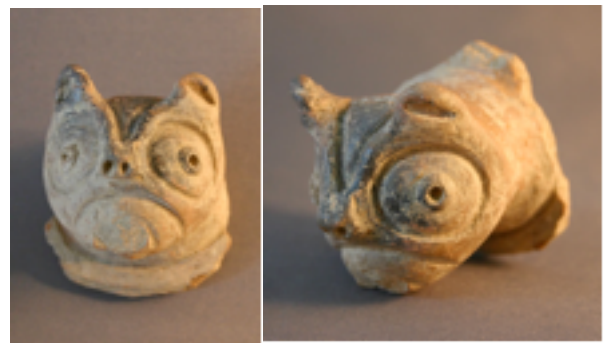
Figure 24. Huecoid screech owl adorno with modeled ear tufts, Morel, Guadeloupe, 1 1/2 in. width. Direction Régional des Affaires Culturelles, Guadeloupe.