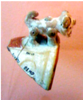
Figure 10. White-on-red canine full-body adorno, unknown site (possibly Vivé), Martinique, approximately 1 1/2 in. x 1 1/2 in. Musée Départemental d'Archéologie Précolombienne et de Préhistoire de la Martinique.

Dogs. Saladoid dog adornos, and related Huecoid ones from the northern Leeward Islands, have shorter, rounder muzzles than those of armadillos, opossums or any other terrestrial mammal depicted in Saladoid ceramics. Rounded heads taper to the muzzle in a manner quite naturalistic for a small breed of dog, even when the features on the ceramics are quite stylized. In both Saladoid and Huecoid canine adornos, the torso and legs of the animal are often depicted, all part of a single, sometimes openwork adorno ( Figures 10 and 11 ). In such cases the legs of the zoomorph emerge from the rim of the vessel creating openings beneath the animal's body, as the dog peers outwards, upwards or in towards the vessel's interior. Occasionally, dog adornos are augmented with pigments, emphasizing their noses and eyes ( Figure 12 ).