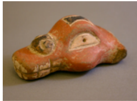
Figure 50. Stylized caiman adorno, unknown site, Carriacou, 2 3/8 in. length. Smithsonian National Museum of the American Indian Cultural Resources Center, Suitland, Maryland.

Frogs . Frog imagery is among the most diverse in Saladoid pottery. Some modeled frogs are plainly mimetic, clinging with flexed legs to vessel walls (Figure 51) in the manner of the region's many species of piping frogs ( Eleutherodactylus genus). Others are abstract, minimal tabular adornos protruding slightly off pot rims (Figure 52). Some adornments combined the stylized features of frogs within the otherwise naturalistic contour of the animal (Figure 53) and yet other representations seem to adapt many of the aforementioned features and conventions to a program of painted adornment (Figure 54). A particularly abstract and very widespread Saladoid motif appears on modeled,