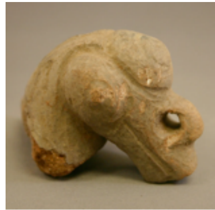
Figure 28. Turkey vulture adorno with looped nares, Saladero, Venezuela, 2 in. length. Yale Peabody Museum of Natural History Anthropology Department, Greenwich, Connecticut.

Pelicans and Wading Birds. Long beaks in Saladoid adornos and strap handles can be identified as those of aquatic birds. Previous scholarship on Saladoid ceramics has tended to identify most long-beaked aquatic birds as pelicans (Kirby 1976: 15; Nicholson 1976: 259, 262). However, several different sets of features can be observed on these ceramic birds which lead me to conclude that they represent not only brown pelicans ( Pelicanus occidentalis ) but also ciconiiformes such as herons, xi egrets and ibises. xii