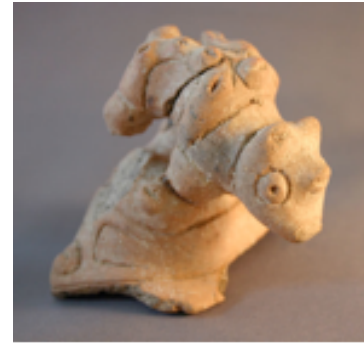
Figure 11. Huecoid canine adorno (with broken hind leg), Morel, Guadeloupe, 2 1/2 in. length. Direction Régional des Affaires Culturelles, Guadeloupe.