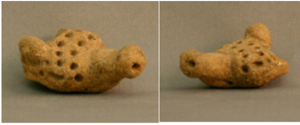
Figure 9. Punctated opossum adorno, unknown site, Grenada, 1 in. length. Florida Museum of Natural History, Gainesville, Florida.

Dogs. Saladoid dog adornos, and related Huecoid ones from the northern Leeward Islands, have shorter, rounder muzzles than those of armadillos, opossums or any other terrestrial mammal depicted in Saladoid ceramics. Rounded heads taper to the muzzle in a manner quite naturalistic for a small breed of dog, even when the features on the ceramics are quite stylized. In both Saladoid and Huecoid canine adornos, the torso and legs of the animal are often depicted, all part of a single, sometimes openwork adorno ( Figures 10 and 11 ). In such cases the legs of the zoomorph emerge from the rim of the vessel creating openings beneath the animal's body, as the dog peers outwards, upwards or in towards the vessel's interior. Occasionally, dog adornos are augmented with pigments, emphasizing their noses and eyes ( Figure 12 ).