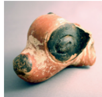
Figure 12. Polychromed dog adorno representing either natural markings or ritualistically applied pigments, Vivé, Martinique, 2 1/2 in. length. Direction Régional des Affaires Culturelles, Martinique.