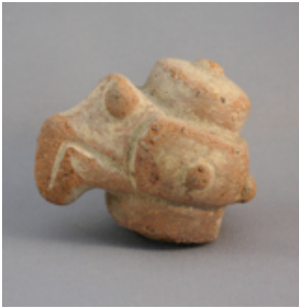
Figure 26. Stylized Saladoid-Barrancoid vulture adorno, Erin, Trinidad, 2 in. length. National Museum and Art Gallery, Trinidad.

but are placed on the same unique part of jugs and bottles: the spouts ( compare Figures 27 and 41 ). In the Antilles, Saladoid potters quite frequently also placed night birds on spouts ( Figure 23 b ) so that across the Saladoid territories parrots and hunting birds were given this apparently privileged place at the nexus of the shoulder, neck and handle of water vessels. In some examples, the Saladoid ceramicists took the trouble to make an open loop of the nares ( Figure 28 ), clearly indicating the similar feature on turkey vultures ( Cathartes aura ). Other examples without this bold opening in the ceramic might also represent the turkey vulture but may be black vultures as well. Rarely, a large, crest-like formation atop the beak of a specimen might suggest the prominent carunculae of the non-endemic king vulture ( Sarcoramphus papa ) ( Figure 1 ).