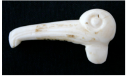
Figure 36. Frigatebird shell amulet, Portland, Guadeloupe, approximately 2 1/2 in. length. Guadeloupe: Musée Edgar Clerc.

Ducks. The bodies and distinctive flat bills of ducks appear on a number of very different ceramic adornments. Several duck adornments incorporate a major part of the ceramic vessel rather than being confined to the adorno form as with many other zoomorphs. Some duck vessels adopt the shape of a duck's head ( Figure 37 ) while others take the duck's body floating on water as their model ( Figure 38 ). Two classes of adornos seem to represent the duck's head. One of these represents a fairly naturalistic, perhaps whistling duck species ( Dendrocygna genus) ( Figure 39 ). The other seems to reveal itself as a secondary image in hybrid representations of turtles. In this second variety of duck adorno, a highly stylized sub-group of turtle adornos with tall lateral (rather than sagittal) crowns atop their heads seem to become duck heads much like the less ambiguous duck adornos of the first variety, but only when the turtle adornos are laid face up ( Figure 40 ).