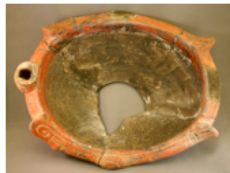
Figure 57. Turtle bowl with broken head, Saladero, Venezuela, approximately 11 in. length. Yale Peabody Museum of Natural History Anthropology Department, Greenwich, Connecticut.

These round, often painted adornos appear in collections from Grenada to Puerto Rico, seeming to have evolved somewhere in the Windward Islands. Moravetz has catalogued several variations of these stylized turtles in St. Vincent (Moravetz 2005: 33-44), including some with elaborate crowns or crests above their heads ( Figure 62 ). I interpret these often punctated and incised “crests” as representing the arch-shaped hollow behind the turtle’s head created by the leading edge of the carapace (especially in green, loggerhead and hawksbill sea turtles but also land turtles). As mentioned above, some of these crests enable the turtles to become other creatures as the adorno is turned. Most of Moravetz’s Vincentian variations appear throughout the Windwards and Leewards north of Tobago. No kind of “crested” turtle adorno is found in the Lower Orinoco. One vessel fragment from St. Vincent featured in two-dimensional white-on-red slip paint the same round turtle head as in Lesser Antillean adornos ( Figure 63 ).