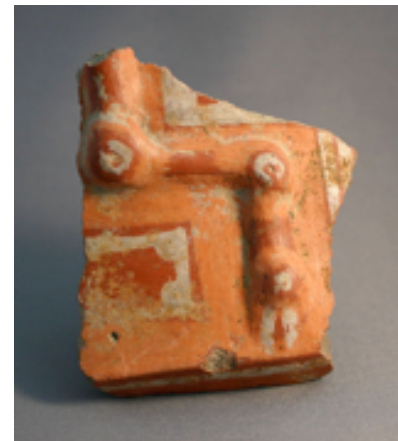
Figure 54. Vessel fragment with geometric, modeled frog limb, unknown site, St. Vincent, 3 x 2 in. St. Vincent and the Grenadines National Trust Museum, St. Vincent.