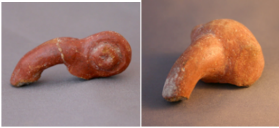
Figure 33. Wading bird adornos: (a) unknown site, Guadeloupe, 1 1/2 in. length; (b) unknown site, Guadeloupe, 2 in. length. Guadeloupe: Musée Edgar Clerc.