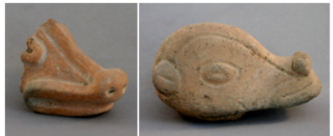
Figure 8. Opossum adornos with framed faces and bulbous noses, Erin, Trinidad: (a) adorno fragment, 1 7/8 in. length; (b) complete adorno, 3 in. length. National Museum and Art Gallery, Trinidad.

Opossums. Adornos were identified as opossums when their heads bore some overall resemblance to armadillo adornos in profile but exhibited no horizontal banding on the head and had a more bulbous nose. There appears to have been some effort on the part of Saladoid potters to evoke the facial color markings of the black eared opossum ( Didelphis marsupialis ) especially, not in slip paint, but in incisions that frame the eyes and face, terminating at the bulbous nose (Figure 8 a and b). The mouths of these apparent opossum adornos are incised near or on the underside of the head, giving the mouth a wincing expression much like that of the actual animal (Figure 9). The ears of these adornos are not as prominent as those on the armadillo or dog adornos. In fact the forms of armadillo, opossum and dog heads are quite similar before the addition of ears, mouths or other distinguishing features, suggesting that Saladoid potters may have learned a basic syllabary of forms (perhaps from tradition-bearing instructors) and varied features to make different animals.