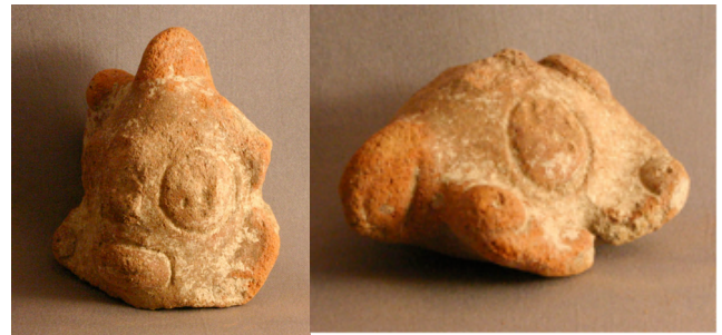
Figure 3. Anthropomorphic adorno that becomes crawling turtle when recumbent, unknown site (probably Elliot's), Antigua, Ceramic with traces of white slip, approximately 2 in. width. John Fuller collection, Antigua.