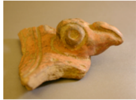
Figure 30. Pelican adorno on incised dish fragment showing distended gular pouch, unknown site, St. Vincent, approximately 2 in. length. Smithsonian National Museum of the American Indian, Cultural Resources Center, Suitland, Maryland.