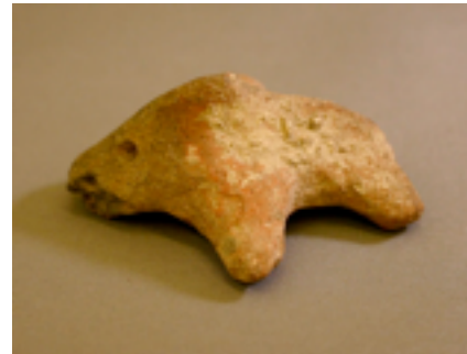
Figure 66. Dolphin adorno, unknown site, Mustique (Grenadines), 2 in. length. Smithsonian National Museum of the American Indian Cultural