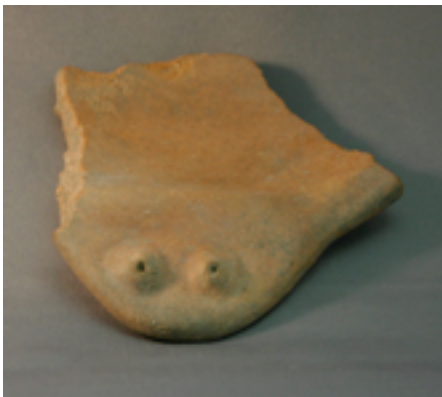
Figure 52. Tabular frog lug on fragment of shallow dish, unknown site, Tobago, approximately 3 in. width. Tobago Museum, Tobago.