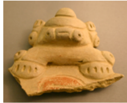
Figure 53. Stylized frog adorn with elaborate plastic elements, Vivé, Martinique, 3 1/4 in. width. Direction Régional des Affaires Culturelles, Martinique.