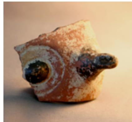
Figure 25. Vessel fragment possibly depicting endemic nightjar (St. Lucia nightjar, Caprimulgus otiosus , or Martiniquian white-tailed nightjar, Caprimulgus cayennensis ), Tourlourous, Marie Galante (Guadeloupe Archipelago), 1 7/8 in. width. Direction Régional des Affaires Culturelles, Guadeloupe.

Vultures. Vultures are identified by powerful raptorial beaks, hooked on the end, with the enlarged nares that distinguish them from other birds with large beaks, such as parrots ( Figure 26 ). However, in Venezuelan and Antillean Saladoid ceramics vultures and parrots do not only share some similar features