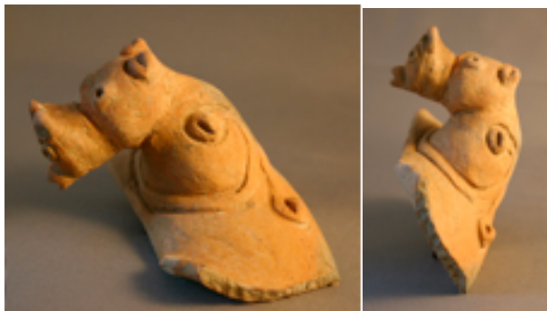
Figure 18. Huecoid composite canine-manatee adorno, Gare Maritime, Guadeloupe, 1 1/2 in. x 2 1/2 in. (adorno only). Direction Régional des Affaires Culturelles, Guadeloupe.

Bats. The heads and wings of bats are common motifs in Saladoid ceramics. Their upturned noses, often with slit-shaped nostrils are distinctive features ( Figure 19 ). Upturned noses are a typical characteristic of the leaf-nosed family of bats, Phyllostomidae , to which the fruit bats of the Caribbean belong ( Figure 20 ). The ears of Saladoid ceramic bats are not particularly mimetic and in fact they often bear the stylization employed for human ears, located on the sides of the face with a circular motif at top or bottom in the manner of an earring or ear spool ( Figure 21 ). What appears to be a curled bat wings motif appears on the interior and exterior of bowls, on the faces of ceramic anthropomorphs and on at least one pot stand from Tobago. The motif has a scroll-like shape, curled on each end and either flat or V-shaped in the middle ( Figure 22 ). ix A triangular or circular motif in the center of these abstracted wings sometimes indicates the body or face of the bat.