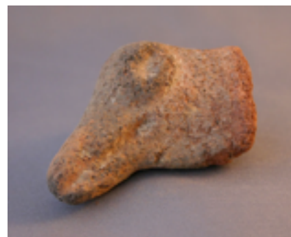
Figure 46. Lizard adorno with possible dewlaps, Morel, Guadeloupe, 1 3/4 in. length. Musée Edgar Clerc, Guadeloupe.

Lizards. It is often only by process of elimination that certain rare adornos can be identified as lizards. These are small adornos depicting only the heads of these reptiles, with large eyes and flat, pointed muzzles ( Figure 46 ). The species most likely represented in these simple sculptures would be anoles ( Anolis genus) and the genera of pre-contact geckos, not iguanas with their prominent nuchal and dorsal crests or the flat-sided triangular heads of ground lizards.