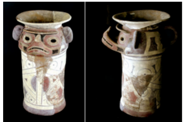
Figure 20. Bat censer with pot stand rim, Arnos Vale Swamp, St. Vincent, Saladoid, approximately 22 in. height. St. Vincent and the Grenadines National Trust Museum, St. Vincent.