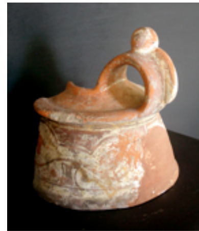
Figure 31. Wading bird strap handle on censer fragment, unknown site, St. Vincent, approximately 7 in. diameter. St. Vincent and the Grenadines National Trust Museum, St. Vincent. Photograph and sketch of zoomorph by author.