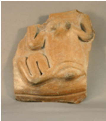
Figure 51. Frog adornment on vessel fragment, Mt. Irvine, Tobago, approximately 3 in. height. Tobago Museum, Tobago.

incised and painted pottery but also other arts throughout the Lesser Antilles: that of the four legs of a circular or oval zoomorph flexed in the manner of a frog with a complex system of tracery surrounding the body and legs of the motif. This is Petitjean Roget's frog "labyrinth" motif (1975: 177-180) found on amulets, pendants, trigonal zemis and other objects ( Figure 55 ). This frog motif reappears in Taíno arts of the second millennium demonstrating its Pan-Antillean importance. It can be traced all the way back to Saladero where it appears to have had looser, more naturalistic precursors ( Figure 56 ) before becoming a deft logo-like symbol from Saladoid Barbados to Taíno Hispaniola.