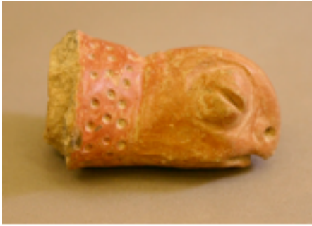
Figure 58. Hawksbill turtle adorno with punctated collar, unknown site, Montserrat, 1 1/2 in. length. Smithsonian National Museum of the American Indian Cultural Resources Center, Suitland, Maryland.