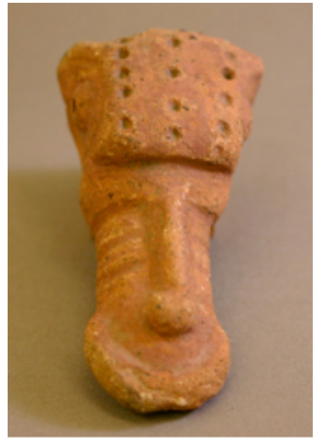
Figure 49. Stylized caiman adorno with punctated scutes, unknown site, Carriacou, 2 1/2 in. length. Smithsonian National Museum of the American Indian Cultural Resources Center, Suitland, Maryland.