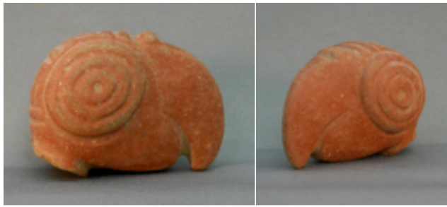
Figure 42. Parrot or macaw adorno, Golden Grove, Trinidad, 1 7/8 in. length. University of the West Indies, Archaeology Centre, Trinidad.