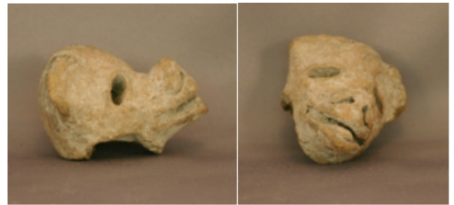
Figure 19. Profile and frontal views of bat-face adorno, unknown site, Barbados, approximately 2 1/2 in. length. Barbados Museum, Barbados.

Bats. The heads and wings of bats are common motifs in Saladoid ceramics. Their upturned noses, often with slit-shaped nostrils are distinctive features ( Figure 19 ). Upturned noses are a typical characteristic of the leaf-nosed family of bats, Phyllostomidae , to which the fruit bats of the Caribbean belong ( Figure 20 ). The ears of Saladoid ceramic bats are not particularly mimetic and in fact they often bear the stylization employed for human ears, located on the sides of the face with a circular motif at top or bottom in the manner of an earring or ear spool ( Figure 21 ). What appears to be a curled bat wings motif appears on the interior and exterior of bowls, on the faces of ceramic anthropomorphs and on at least one pot stand from Tobago. The motif has a scroll-like shape, curled on each end and either flat or V-shaped in the middle ( Figure 22 ). ix A triangular or circular motif in the center of these abstracted wings sometimes indicates the body or face of the bat.