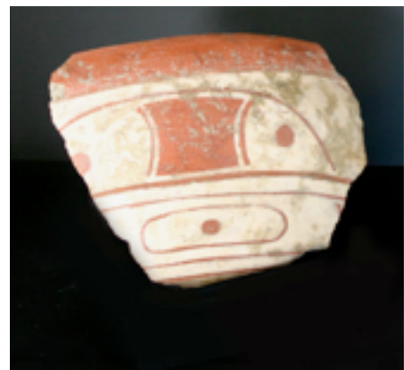
Figure 63. Stylized turtle face painted on white-on-red vessel fragment, unknown site, St. Vincent, approximately 5 in. width. St. Vincent and the Grenadines National Trust Museum, St. Vincent.