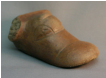
Figure 40. Turtle adorno head facing up with tall crown or "crest" that becomes duck bill when recumbent, unknown site, Bequia (Grenadines), 2 1/2 in. length. Tobago Museum, Tobago.

Parrots and Macaws. Saladoid depictions of parrots and other psittacids typically have large, but relatively short and decurved beaks quite similar to those of actual psittacidae ( Figure 41 ). Even when their nares are emphasized to the point of resembling vultures' they are clearly meant to depict members of the