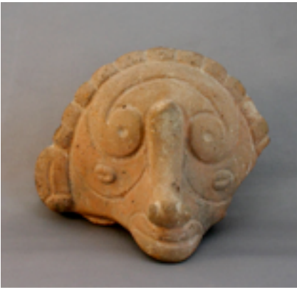
Figure 22. Anthropomorphic adorno with scroll-like bat-wings motif connecting the eyes, Erin, Trinidad, 3 in. x 2 7/8 in. National Museum and Art Gallery, Trinidad.

Owls. Saladoid ceramic depictions of owls and other night birds are distinguished by their large eyes, often-round faces and decurved or wedge-shaped beaks, usually in combination ( Figure 23 a and b ). Some night bird adornos and vessel fragments, whether Saladoid or Huecoid, display the prominent ear tufts of endemic screech owls ( Otus genus) ( Figure 24 ); others, the heart-shaped faces of barn owls ( Tyto alba ) ( Figure 23 a ). Yet other ceramics seem to conflate a range of ocular, round-eyed birds with short, decurved beaks, seeming to include oilbirds ( Steatornis caripensis ). A few combine owl-like eyes with the straighter, narrow beak of the nightjar ( Caprimulgus genus) ( Figure 25 ). My research into the mythology of all these nightbirds in tropical lowland and Pre-Columbian Caribbean culture indicated that this conflation of night birds was possible in Saladoid oral and artistic traditions. x