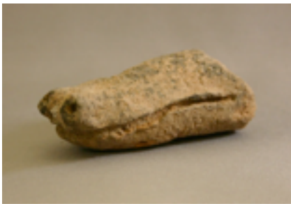
Figure 48. Adorno fragment depicting caiman muzzle with punctated nostrils, Saladero, Venezuela, 2 3/4 in. length. Yale Peabody Museum of Natural History Anthropology Department, Greenwich, Connecticut.