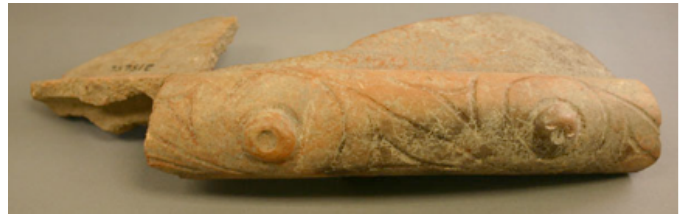
Figure 45. Hollow snake rim fragment with incised and zone-polished patterns, Saladero, Venezuela, 10 in. width. Yale Peabody Museum of Natural History Anthropology Department, Greenwich, Connecticut.

Lizards. It is often only by process of elimination that certain rare adornos can be identified as lizards. These are small adornos depicting only the heads of these reptiles, with large eyes and flat, pointed muzzles ( Figure 46 ). The species most likely represented in these simple sculptures would be anoles ( Anolis genus) and the genera of pre-contact geckos, not iguanas with their prominent nuchal and dorsal crests or the flat-sided triangular heads of ground lizards.